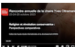
TABLE RONDE INAUGURALE | COLLOQUE ANNUEL DE LA CHAIRE YVES OLTRAMARE